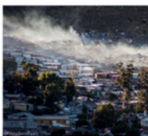
(c) Example of an informal fire