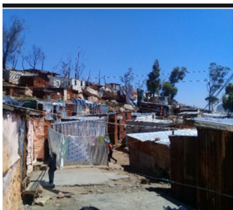
(a) Example of an informal settlement